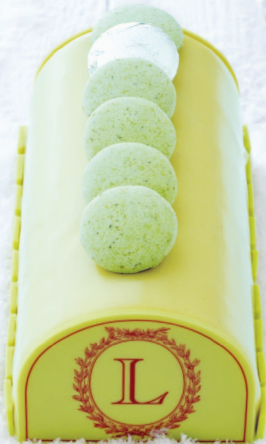
Pistachio Macaron yule log