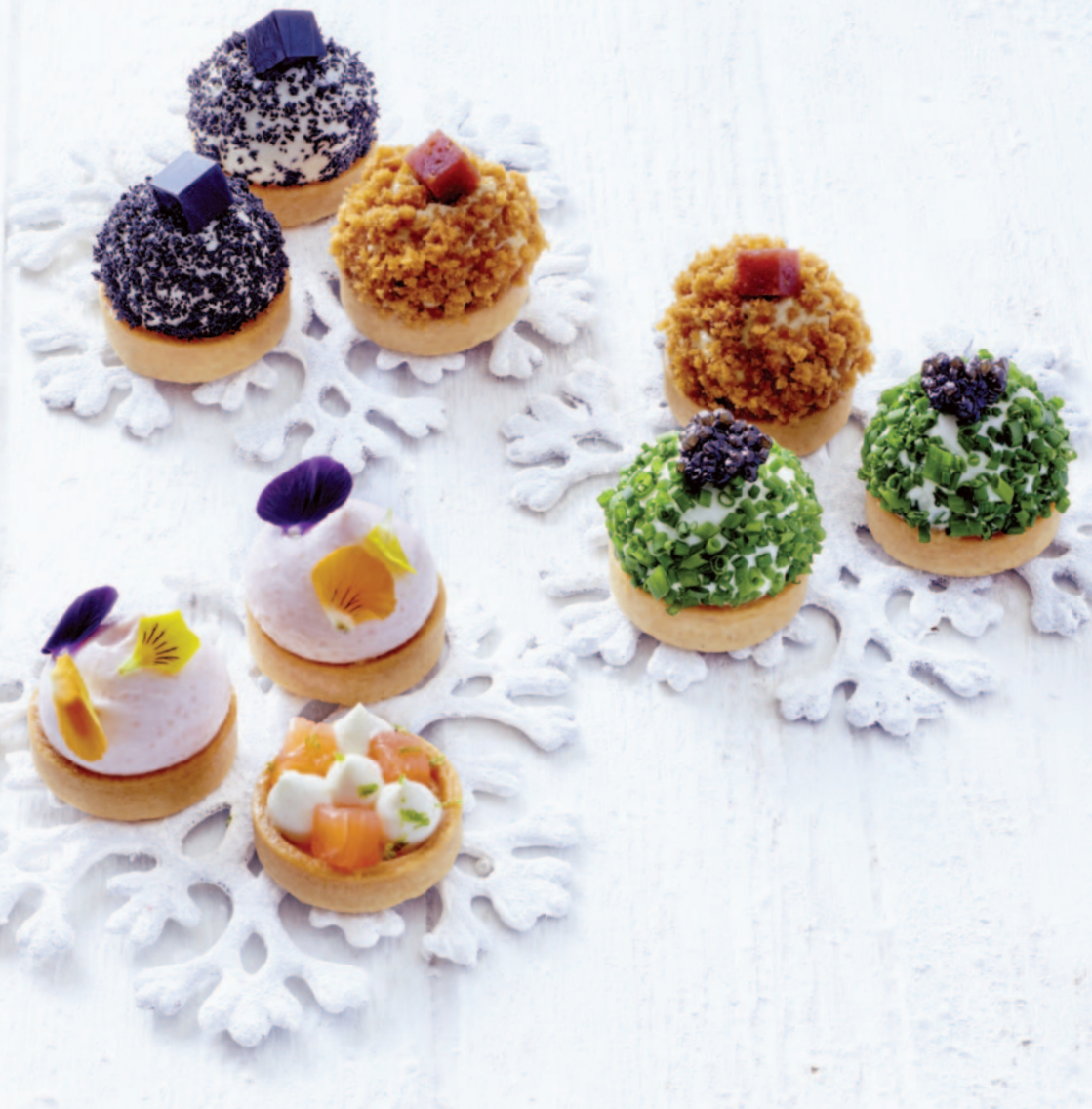
20 savoury canapés $70