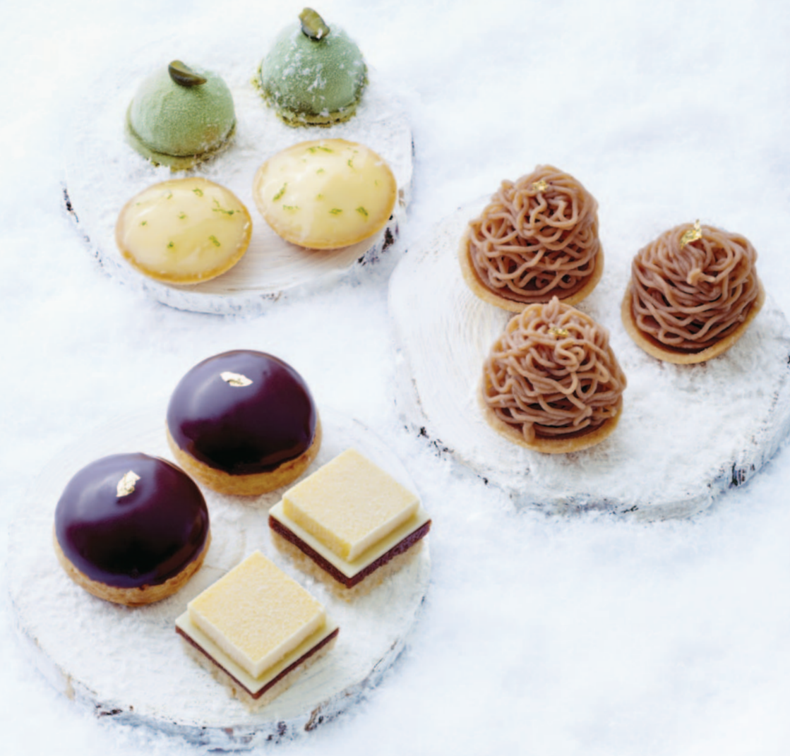
20 sweet petits fours $52.50