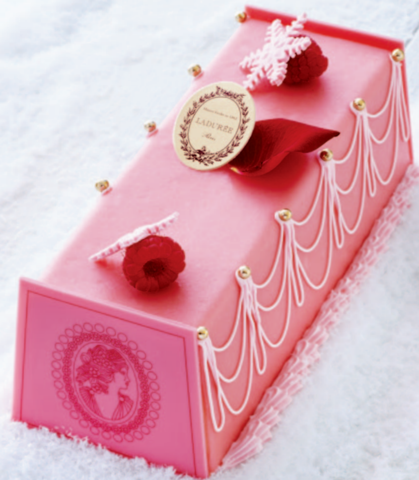
Rose and Raspberry Marie-Antoinette yule log

Individual yule log: $8.50 - Available December 5 th Yule log 6/8 people: $68 - Available December 19 th